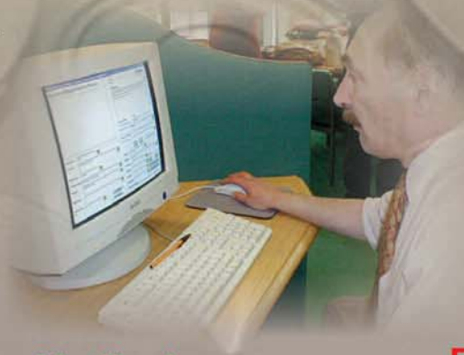
Image Archiving now your images can be catalogued and kept on line.

Enhanced Sales Tool for recording video and image clips of product lines allowing your customer to view on their PC.